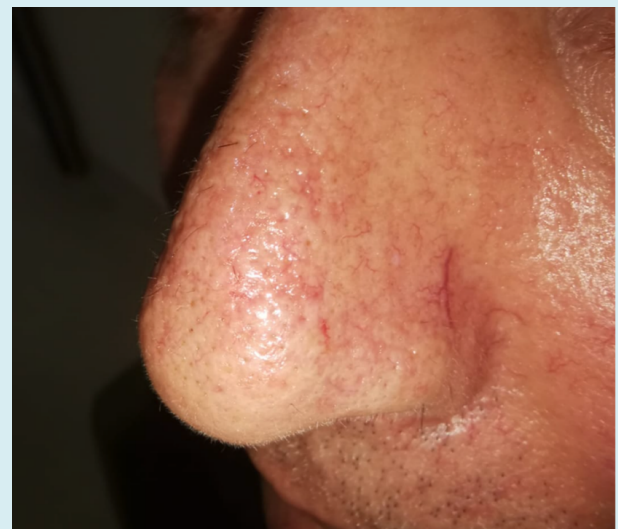
Figure 1: Keratotic papule with well-defined border and slightly atrophic center on the nose.

Cryotherapy was performed to diagnose the porokeratosis.