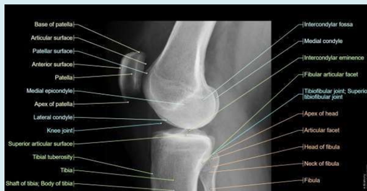
https://www.imaios.com/i/var/site/storage/images/0/1/5/4/484510-1-eng-GB/lowerlimb-radiographs-knee-joint.jpg?caption=1&ixlib=php-3.3.1&q=75&w=1280 Figure 3: Lateral radiographic view of Right Knee.