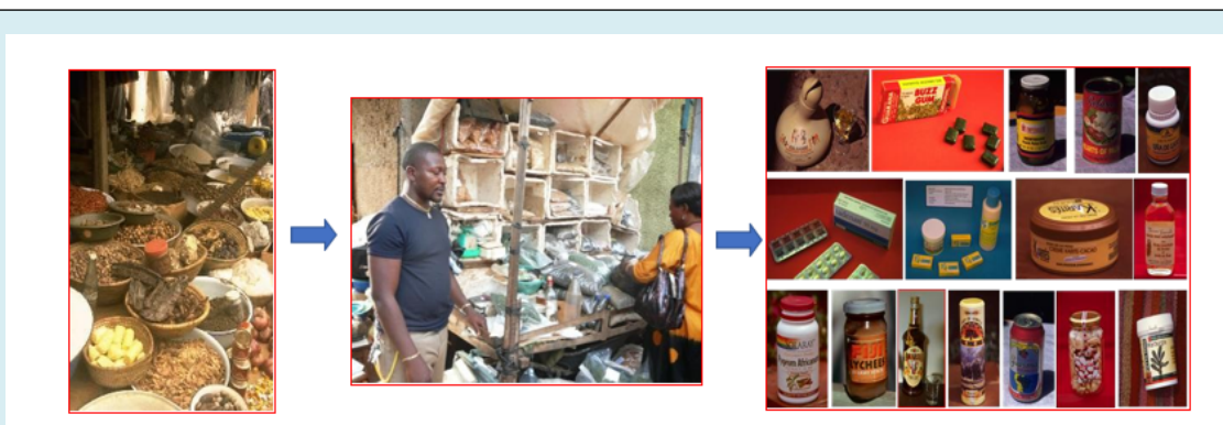
Figure 3: The commercialization of food and medicinal products from indigenous tropical/subtropical trees can be enhanced from the traditional and informal village markets to embrace cottage industries as well as value-adding through new business enterprises and wider trade.

and financial capital for further economic growth. Indeed, for subsistence farmers living in extreme poverty, income gives access to better lifestyles derived from the environmental functions and social services flowing from domesticated trees and the marketing of their products. In this way it offers a complete transformation of their lives in ways that are otherwise impossible.