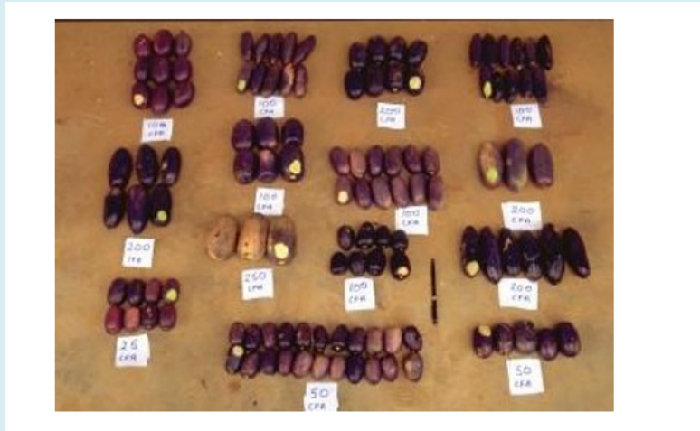
Figure 2: Priced fruits of Dacryodes edulis (Safou) from a market stall in Yaoundé, Cameroon showing the market recognition of tree-to-tree variation in fruit size, flavour, colour and other desirable traits (Source: Leakey, 2012).

these products can be processed for much wider trade to generate much-needed income. This in turn provides the incentive to develop local enterprises and create off-farm employment to further increase product quality and enhanced shelf life for even wider trade. All this can be further developed leading to new businesses and cottage industries; with potential expansion into larger scale, value-adding industries (Figure 3) increasing the economic value of these trees and their products many-fold.